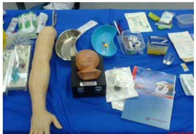
One of the station run for IV cannulation program

Early this year, PMC has organized several courses and program with AHKNS, one of them was the IV cannulation course which was welcomed by the members, we have several workstations for the candidates to practice on basic technique, management of difficult veins and update technology and devices on IV cannulation. Our program's special features was to cover with all aspect of care ranged from theoretical to practical; latest standard & products introduction; infection control perspective, needle stick injury prevention and Management,..etc.